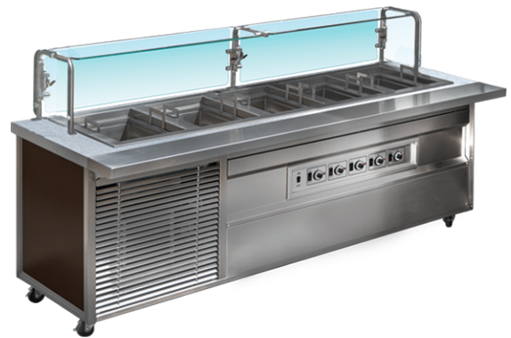
Work Shelf as shown on HCDO5.

G.A. Systems Work Shelf is an accessory which can be added to one or both sides of any G.A. Systems cabinets or your existing countertop. Fabricated of 18 gauge stainless steel. Fold down and removable lift off design.