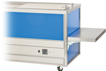
TS18 as shown on H5 Speedline Heated Cabinet.

It is constructed of 18 gauge stainless steel and meets standards of sanitation set forth by NSF.