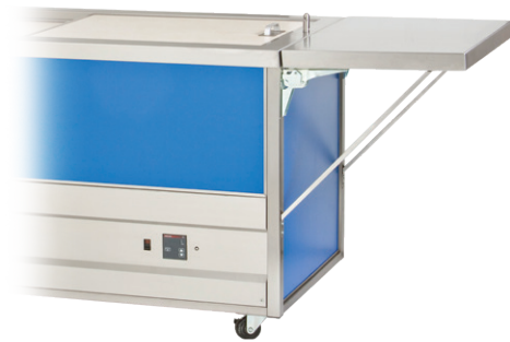
CS20 as shown on H5 Speedline Heated Cabinet.

It is constructed of 18 gauge stainless steel and meets standards of sanitation set forth by NSF.